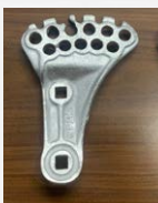
New functional replica!